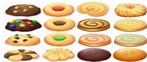
Figure out your "cookie" and Love God and Love Others by Serving God and Serving Others. And if you need help finding your "cookie," come talk to me. We can "cook" something up.

I invite you to consider your spiritual gifts. Don't tell me that you don't have any. You do! Pray to God for discernment and guidance. Try different ministries and activities. Go to a new Bible Study. Try assisting in Worship. What about helping out in the office or cleaning a favorite part of the church building?