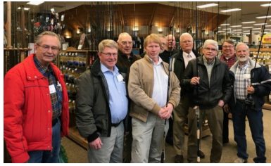
Breakfast with the Bishop ~ April 21, 2018

We will leave from the church at 7:45 AM.